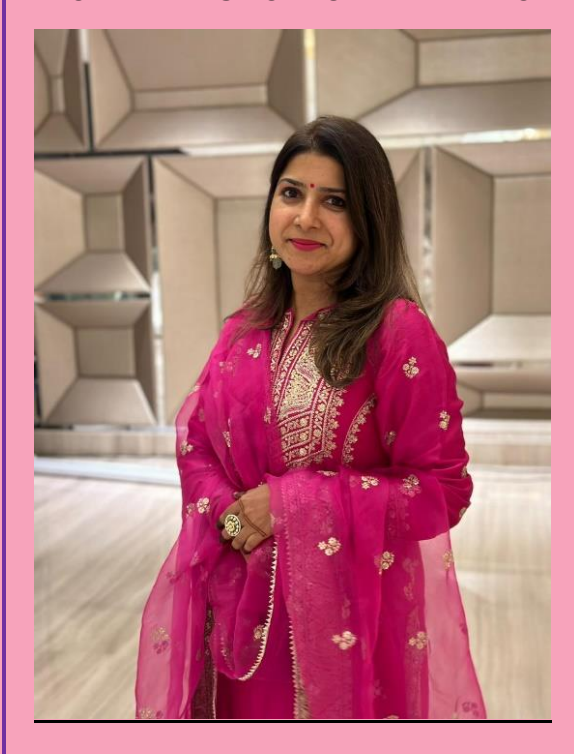
My dear Rotary Surat West family,

The festive season has begun and Rotary Club of Surat West has Organised back to back programs for Navratri and Diwali .